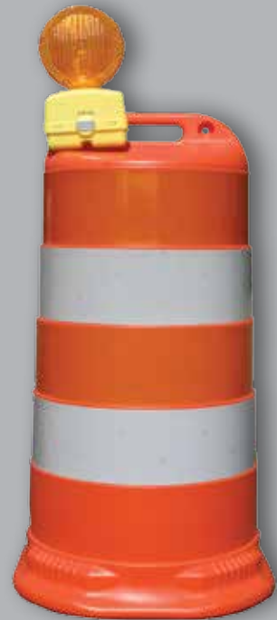
B500LC Channelizer Drum with 4 x 6" HI Sheeting